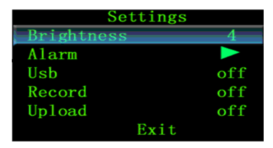
Figure 4 Main Menu Interface

CLICK = short press of power button and PRESS = prolonged push of power button (1sec)