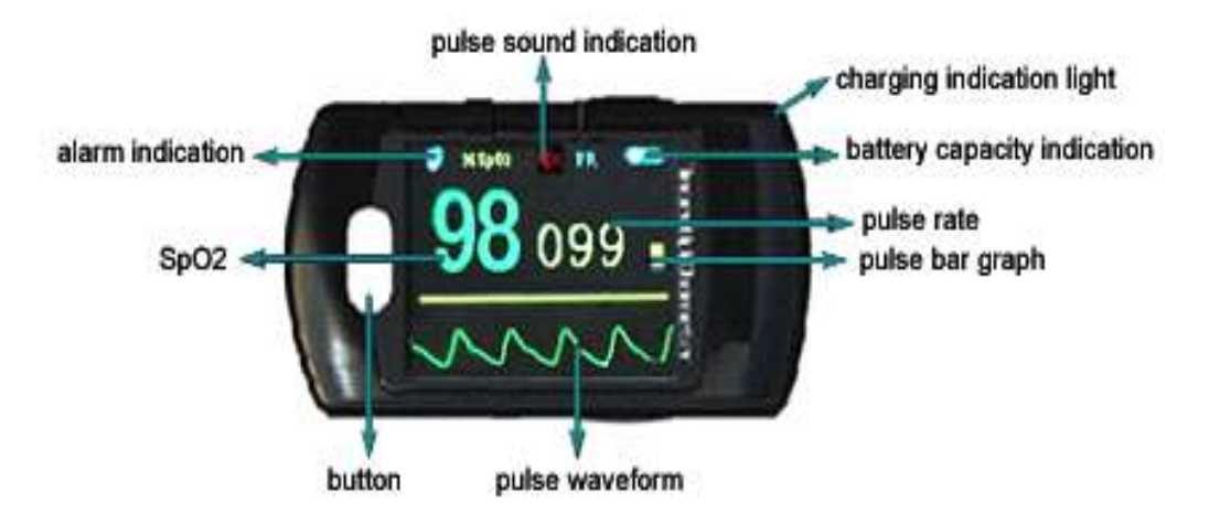
Figure 2. Front View